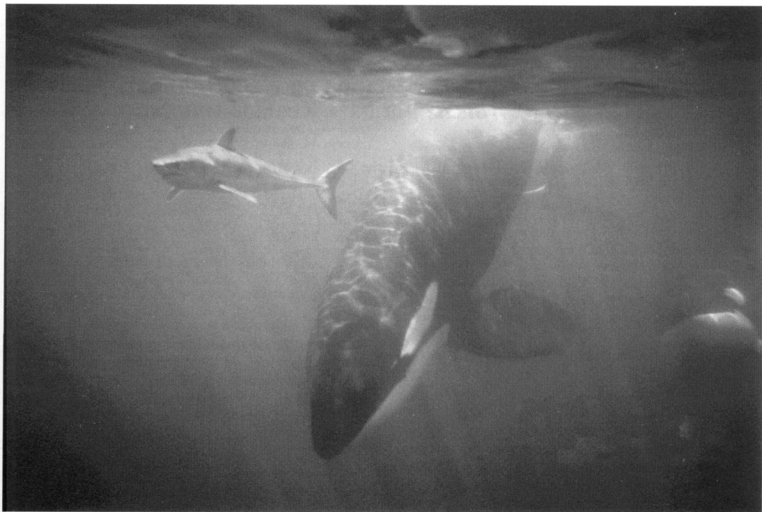
Figure 1. Killer whale (NZ63) with shortfin mako shark, previously held in her mouth, then later consumed.

of claspers (Fig. 2; Cox & Francis, 1997). A few, small puncture marks were seen behind the first dorsal fin on the shark's right side. NZ63 swam abruptly towards the swimmer and shark, 'spooking' the shark from underneath the swimmer. The shark rapidly swam towards the boat, approximately 4.5 m away, and 'hid' under it, in a second attempt to escape from NZ63. The killer whale swam quickly under the boat, bit the shark around the girth, and descended with the shark in its mouth, regrasping it near the tail. A second killer whale (size, age class, or individual identification could not be determined) approached underwater and bit the shark's head as it was held by NZ63. Both killer whales continued to descend whilst consuming the shark, until they could no longer be seen by the underwater observer. At least five whales were observed at the surface (including NZ4, NZ6, NZ9, NZ63 and the unidentified juvenile), milling over the same location where the whales descended with the shark. After five minutes of milling in the same location, the encounter ended when the animals (estimated to be nine individuals at this time, and perhaps including the two previously unidentified animals observed by JB) moved off in an easterly direction.