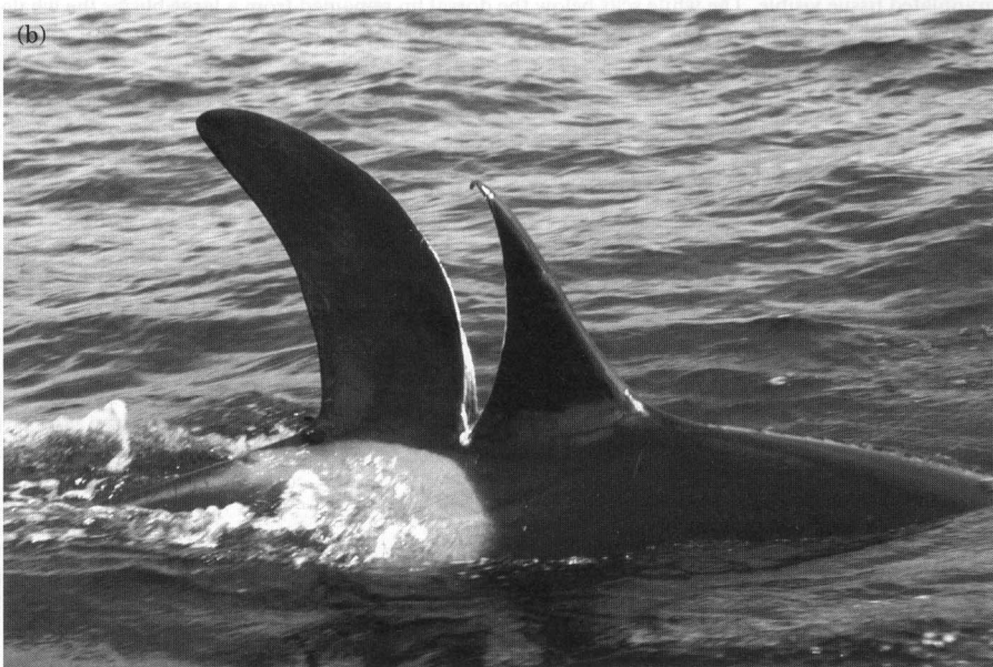
Figure 2. Split dorsal fin of killer whale NZ101 presumed to be caused by a boat strike on 16 October 1998 (first sighting after boat strike), (photographs a. by R. van Meurs and b. Ingrid N. Visser).

'sluggish' and was trailing behind the other killer whales present.