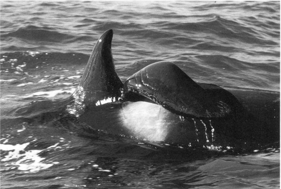
Figure 4. Dorsal fin of killer whale NZ101 where the posterior portion has collapsed on 15 October 1999 (day 365). Open edges of wound are healed over and are dark like rest of the skin on the dorsal fin. The white scar is still visible.